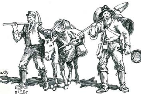
WAGON TRAILS & STEAMBOAT LANDINGS circa 1890

Today, while you speed through this no-place, think of those heroes who first dared to blaze the trail.